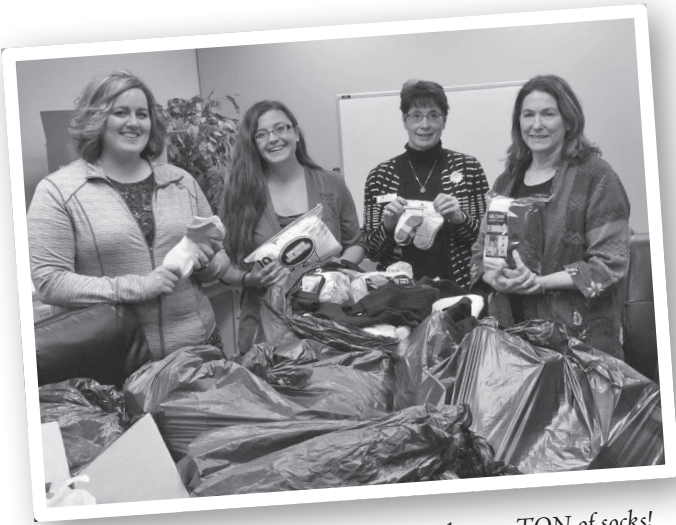
Highmark Federal Credit Union brought us a TON of socks! Thanks to everyone that contributed!