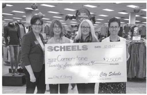
Scheels is such a good friend to Cornerstone!