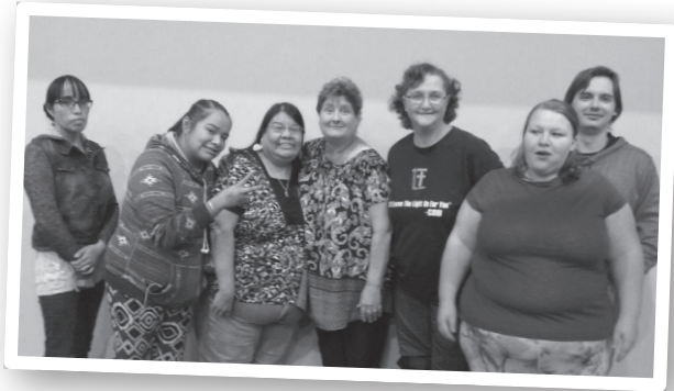
Some of the graduates from the Life Inc classes on Nutrition on a Budget, Healthy Choices, & Financial Freedom. Congratulations!