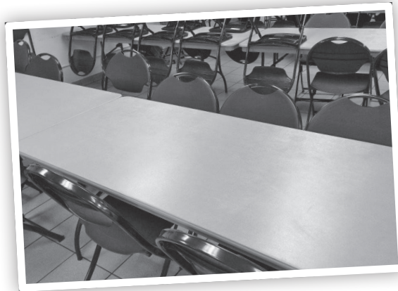
Our Sweetest new tables and chairs!

Our friends at Rapid City Leadership Class of 2016 & Modern Woodmen raised enough money to purchase new tables & chairs for our dining room at 30 Main. Amazing!