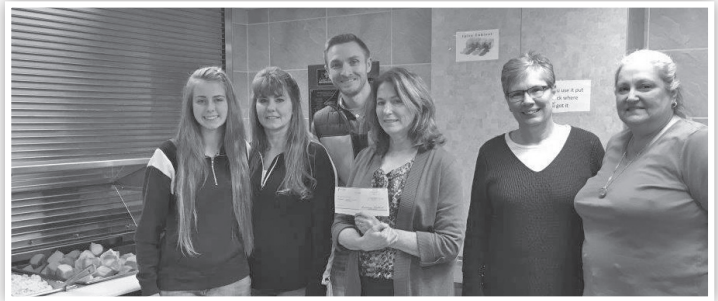
Some of our friends from Synchrony Financial.

We have many groups that prepare and serve meals at Cornerstone - some of them have done it for a very long time! Synchrony Financial is one of those groups. They have been serving a meal once a month at 30 Main for 20 YEARS - fried chicken provided by the employees to be exact. They estimate they have purchased 7,500 chickens in that timeframe - that's a lot of chicken!